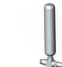
Outlet Pulsation Dampener