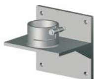
Wall brackets for holding and fixing pumps