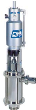
PA.A short pump