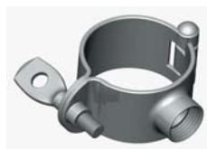
Light clamp with threaded connection