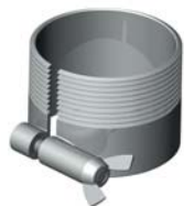
2" threaded clamp for drums